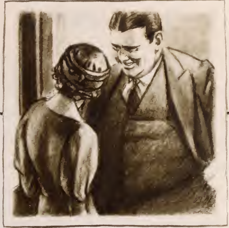
Mr. Wintz leered greasily. "How about a little private audition, baby, huh?" Peg's hand groped for the door knob.

mediately. And when she did sleep she dreamed of Pat playing accompaniments for a brunette blues singer who looked remarkably like Miss Holmes.