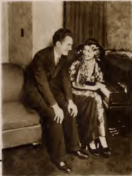
(Left) Fred Waring and Joan Blondell of cinema fame at a party in Washington where Joan was guest of honor. (Below) Ben Bernie and George Olsen vacationing at French Lick, Indiana.