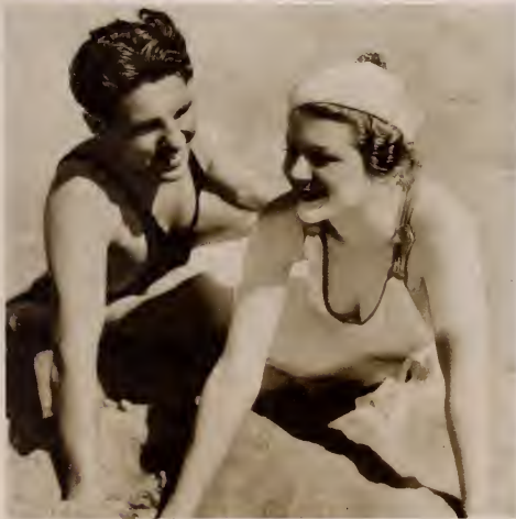
(Above) Ozzie Nelson dashes over to Palisades Park, on the top of the Palisades, opposite New York (for the benefit of you out-of-towners) for a swim with his vocalist, Harriet Hilliard. (Right) Ruth Etting signing an autograph for an avid signature seeker.