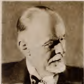
The famous traveler and lecturer, Burton Holmes, who is heard these days in talks on the Century of Progress over the NBC network.