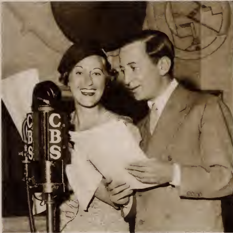
(Left) Grace Moore, the girl with the glorious voice, and Lou Holtz, that ol' master of ye wisecracks, both in fronte of ye goode mike. (Below) H. V. Kaltenborn, Columbia's news commentator, off to Europe to cover the World Economic Conference.