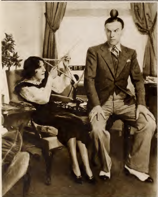
Gracie Allen does a William Tell, with George Burns acting as a target. Don't you admire Gracie's home-made bow and arrow? And wouldn't you like to know what George is thinking?