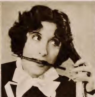
Gracie Allen has suddenly been bitten by the urge to write. Authoress Allen uses a dictaphone. Has the thing a little cockeyed, but still . . .